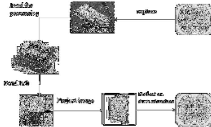
Fig 2 : Working of six sense device

stream data captured by the camera and tracks the locations of the colored markers (visual tracking fiducially) at the tip of the user's fingers. The movements and arrangements of these fiducially are interpreted into gestures that act as interaction instructions for the projected application interfaces. Sixth Sense supports multi-touch and multi-user interaction.