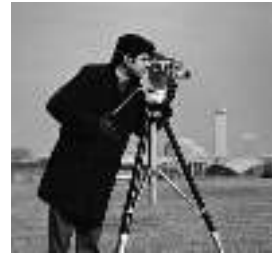
Fig II Stego cameraman.bmp

PSNR between Fig I and Fig II = 51.0870 dB