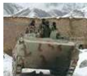
Fig. IV Stego army.bmp

PSNR between Fig III and Fig IV =51.0872 dB