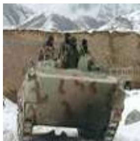
Fig. VII Original army.bmp