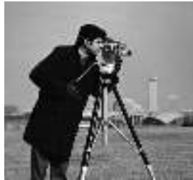
Fig. I Original Cameraman.bmp