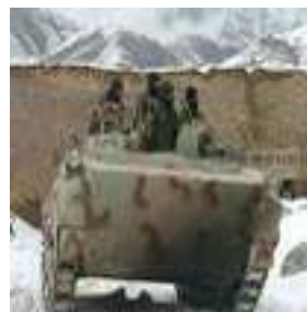
Fig. VIII Stego army.bmp

PSNR between Fig. XVIII and Fig. XIX = 57.2172 Db.