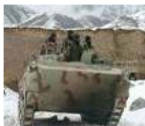
Fig .III Original army.bmp