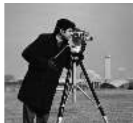
Fig. VI Stego cameraman.bmp

PSNR between Fig V and Fig. VI = 55.3865 dB