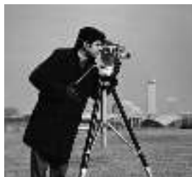
Fig. V Original cameraman.bmp