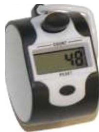
Fig 1 : Counter

In analyzing spot speed data a number of significant values are obtained. Some of these values are computed directly from the data while others are determined from a graphic representation.