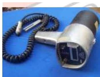
Fig. 2 : Radar meter